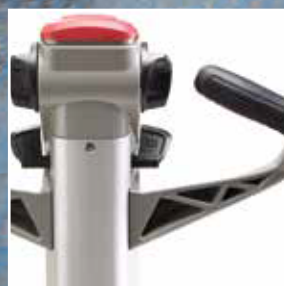
Optional ergonomic levers