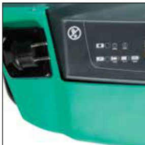
Informative display for built-in charger (option)