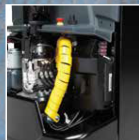
Easy service access