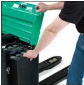
Versatile battery compartment