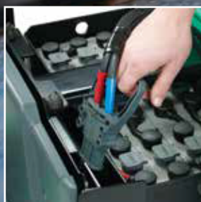
Quick and easy charging