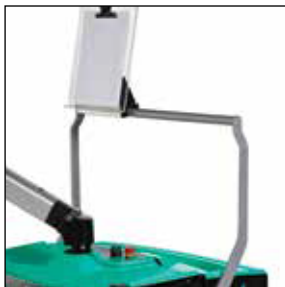
Optional accessory bar