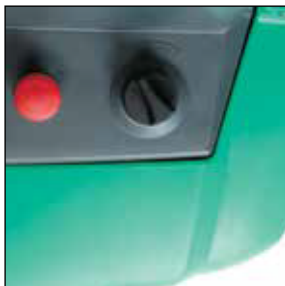
Quick-select performance modes